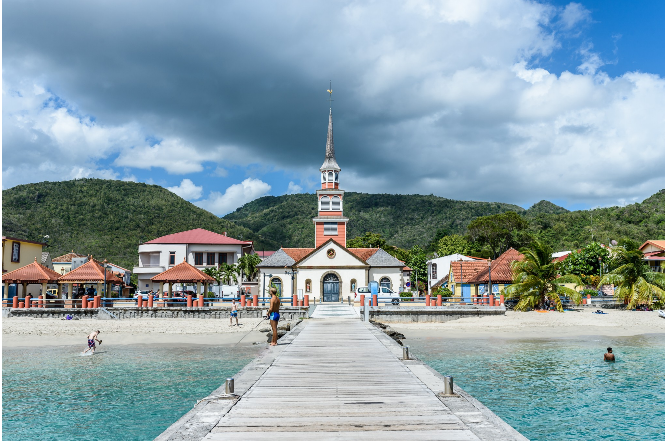
Waking up in Paradise, in the French West Indies