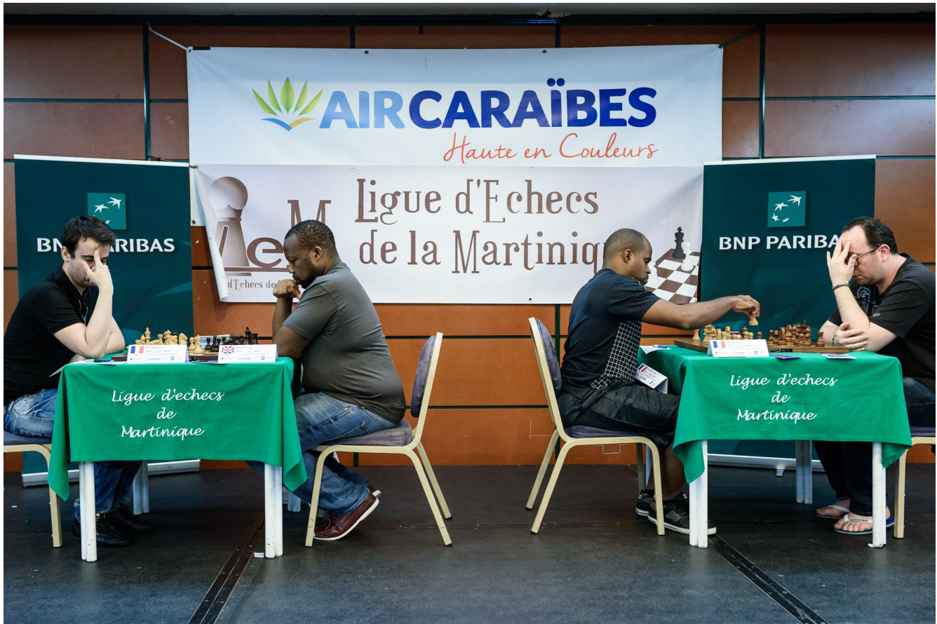
In sync – the French GMs had their share of tough moments