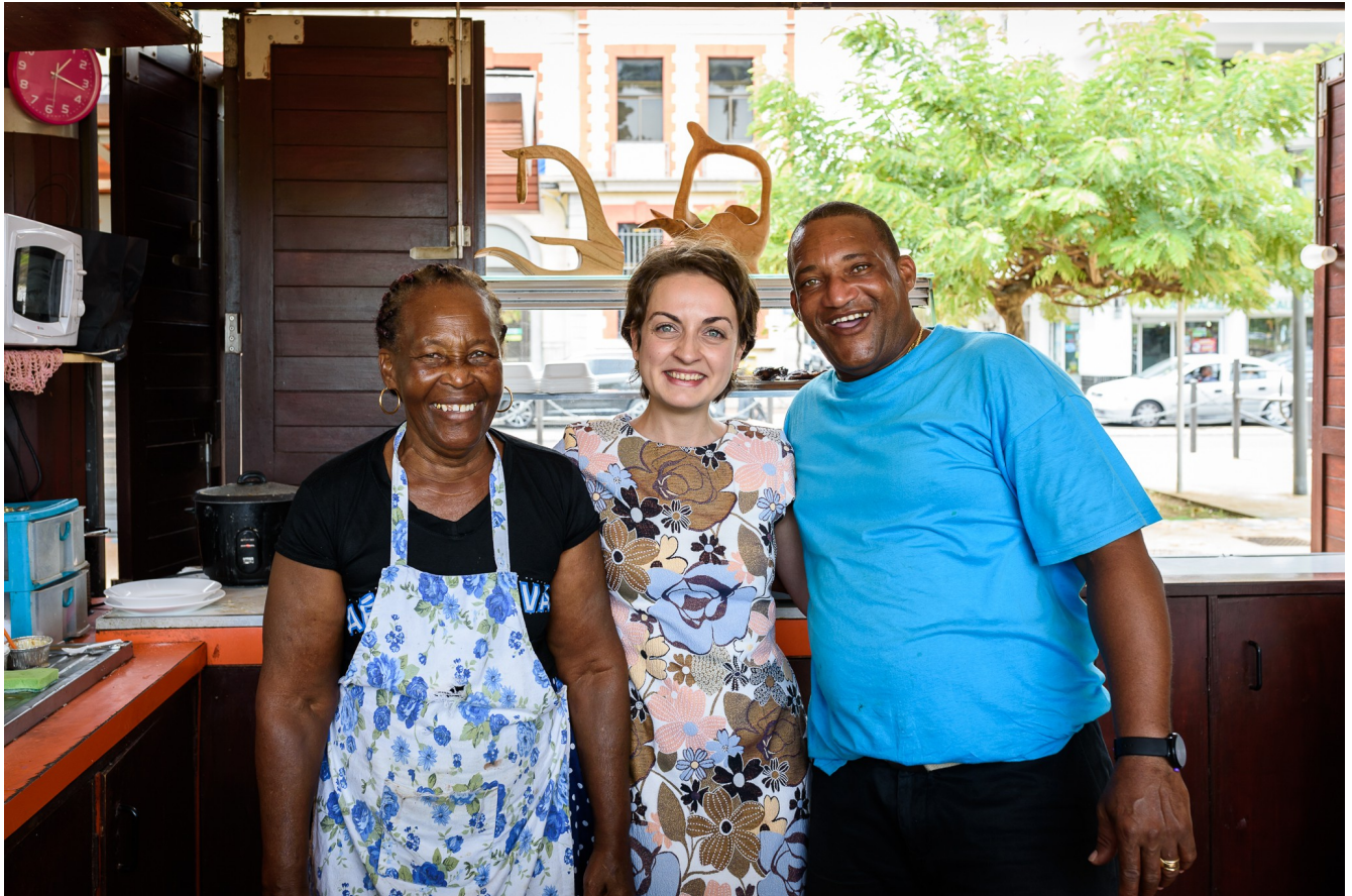
Top-notch culinary options (Michelin street food – arguably the best I ever had)