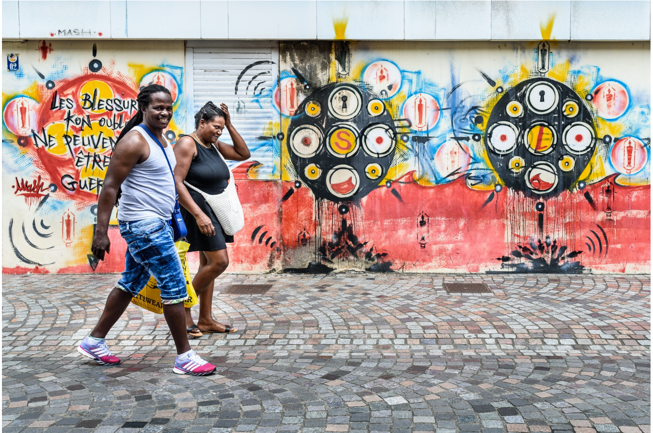
Rich yet tumultuous cultural heritage