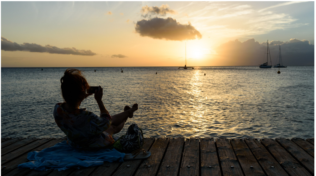
While you are playing your game, the significant other...